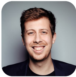
Founder & CEO Sdui Group