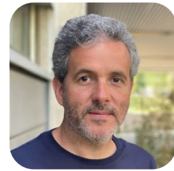
Co-Founder & CEO Additio App