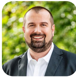
Founder & CEO Pupil